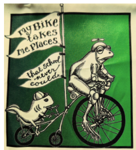
Art from The Beehive Collective